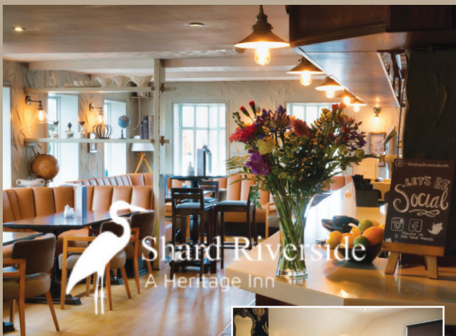
Shard Riverside A Heritage Inn