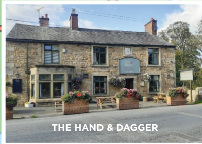
THE HAND & DAGGER