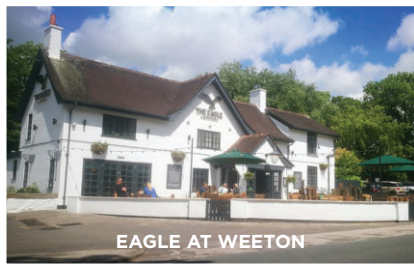
EAGLE AT WEETON