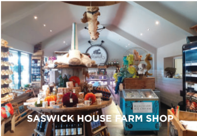
SASWICK HOUSE FARM SHOP