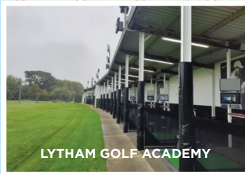
LYTHAM GOLF ACADEMY