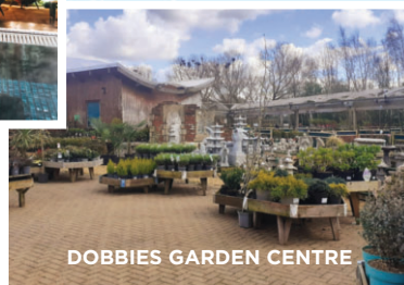
DOBBIES GARDEN CENTRE