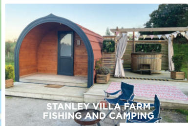
STANLEY VILLA FARM FISHING AND CAMPING