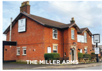
THE MILLER ARMS

Tel: 01253 836883 established over 20 years, providing many authentic Indian and Bangladeshi dishes of the highest quality.